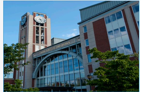
The Center for Law and Justice at Rutgers University-Newark is one of many Rutgers buildings that will receive new lighting and sensors as part of the Large Energy Users Program.

A building-by-building approach can, however, be difficult for an institution or business the size of Rutgers. Beginning in 2015, officials turned to the more streamlined process offered through the NJCEP Large Energy Users Program.